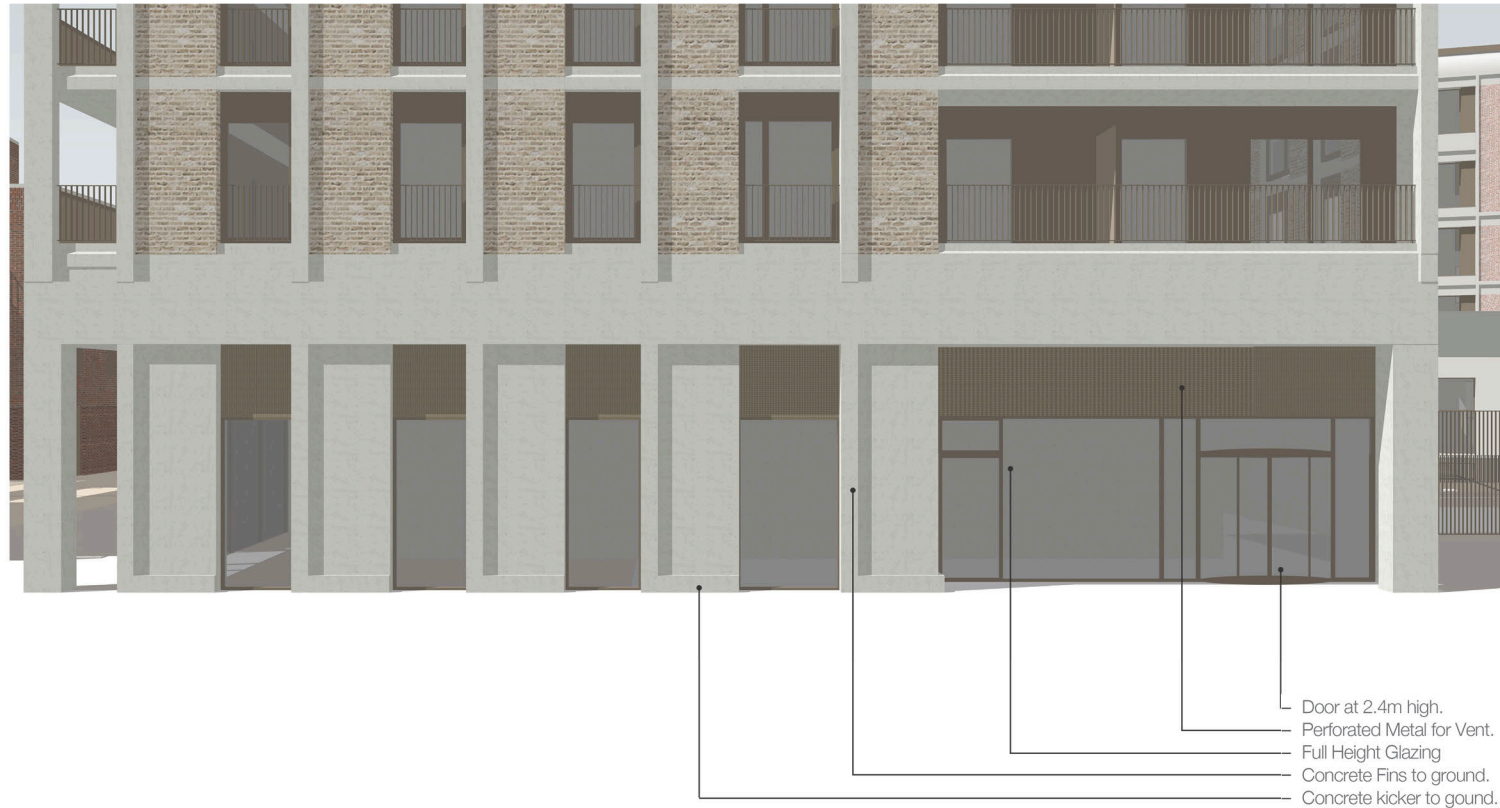
H5 Grange Road Elevation: