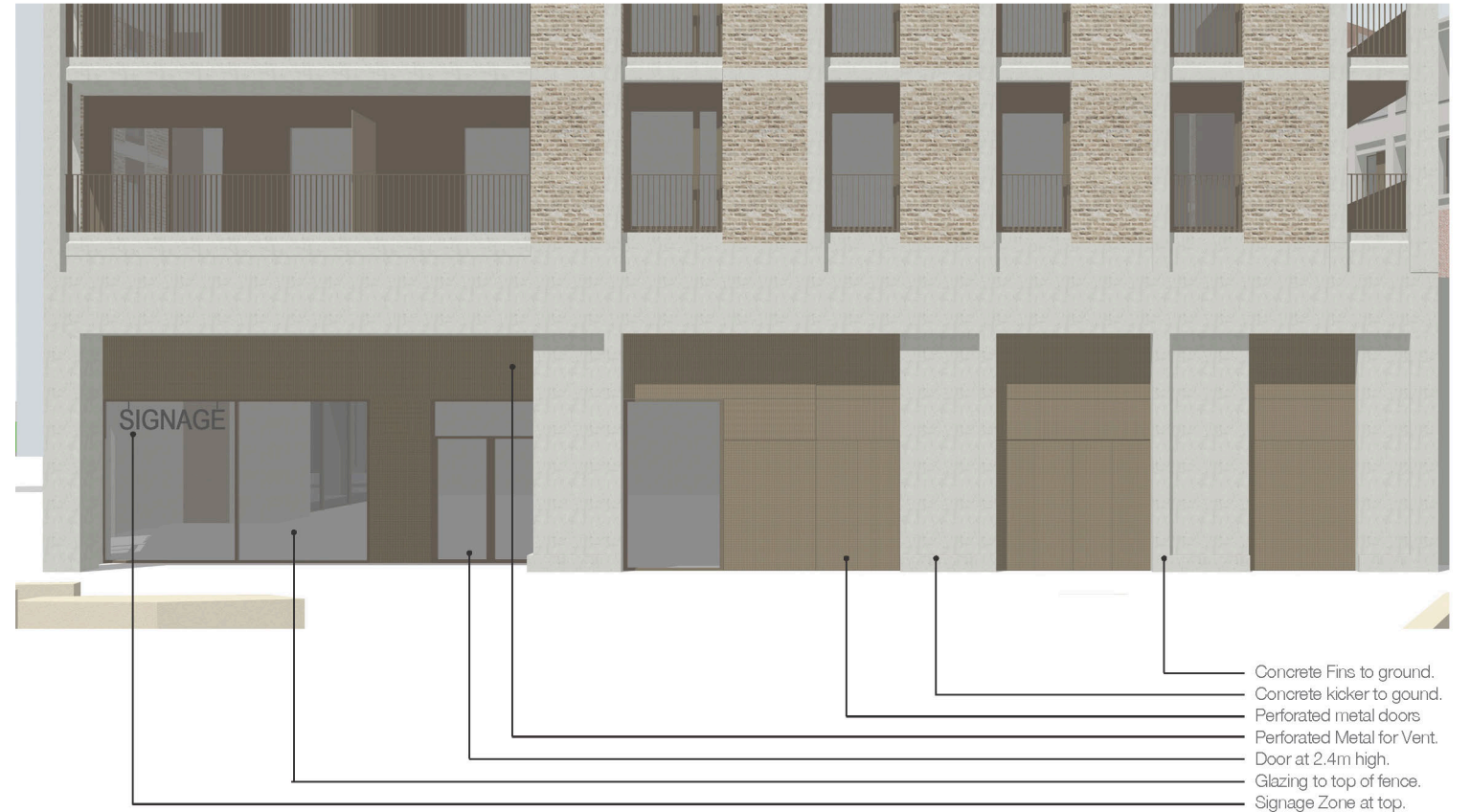
H6 Pitfield Street Elevation: