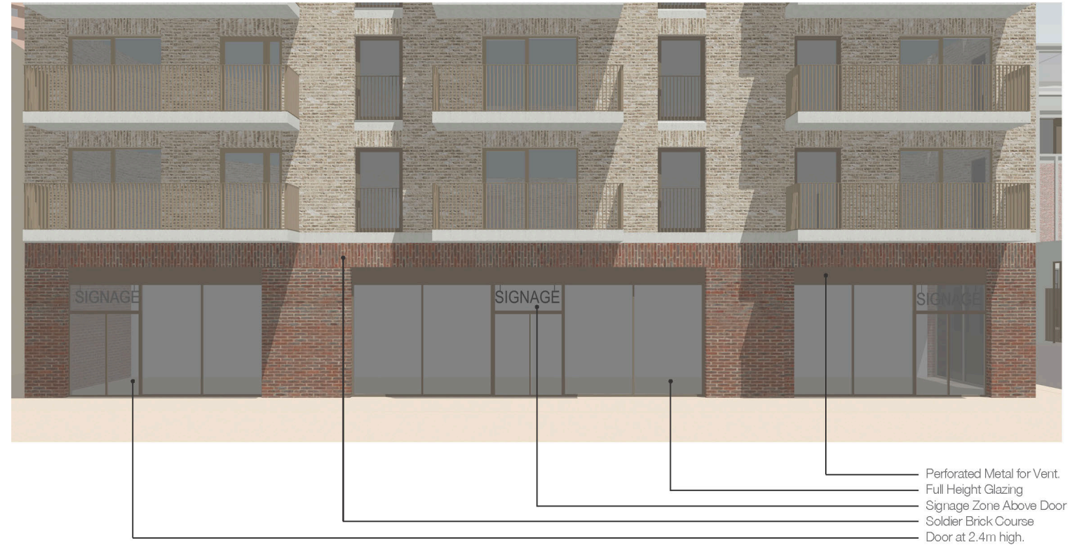
H3 Grange Road Elevation:

The facades to the commercial units, above the glazing, also have a metal perforated zone for services, this language of perforated metal panels is repeated on the residential facades to accommodate the servicing strategy for the building.